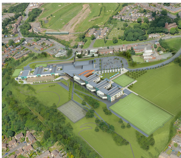
Sandwell's Rowley Learning Campus